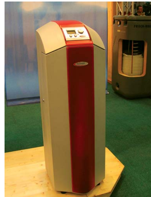
Figure 1 & 2 heat pump and the installation of the ground loop

A horizontal collector system consists of a series of pipes laid out in trenches, usually one to two meters below the surface, which are backfilled. Afterwards, normal landscaping can be applied and the area used as parkland, gardens or car-parking. In cases where there is not enough space for a horizontal ground loop vertical boreholes can be used.